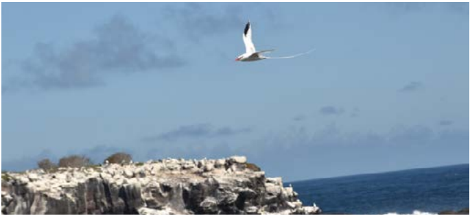
pm – Gardner Bay, Gardner & Osborn islets (Española Island)

One of the most stunning beaches in all of Galapagos. The long, white, sandy beach, lapped by turquoise waters is home to a colony of Galapagos sea lions, indifferent to the humans that walk amongst them. The Hood mockingbirds, endemic to this particular island, will be eager to inspect the visitors and satisfy their innate curiosity. Darwinis finches may also join the throng including the reclusive warbler finch. We can also snorkel here from the beach, in the shallows of the bay